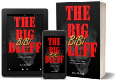
The Big Bibi Bluff - the story of the biggest con man in Jewish history