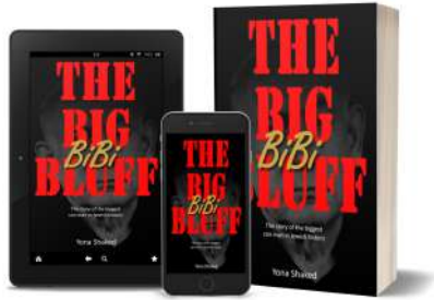
The Big Bibi Bluff – the story of the biggest con man in Jewish history